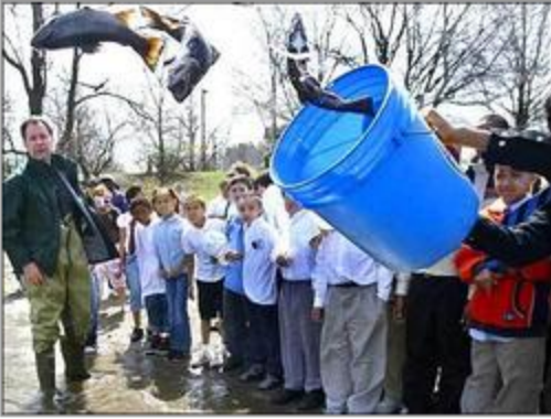
But Jessie's annual feeding?

pretending is fun, according to three neighborhood residents who dreamed up and run a recently-created blog and Twitter page dedicated to the make-believe sea creature, whose name is inspired by the "Nessie" nickname given to the reputed Loch Ness Monster.