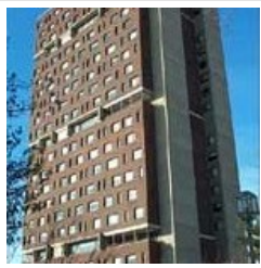
Coolidge Hall