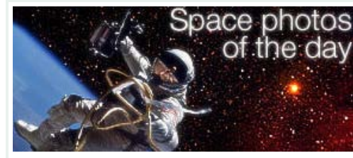
Space photos of the day 08/12