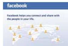
Can social media save the world? Some nonprofits give it a try.