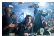
Middle Men: movie review