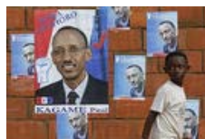
Africa Monitor: Rwanda ex-spy chief says Paul Kagame reaching