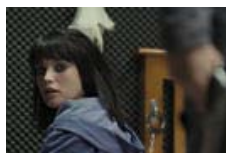
The Disappearance of Alice Creed: movie review