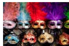
Returning to New Orleans: a photo essay