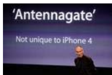
'Antennagate' Not unique to iPhone 4 Did Mark Papermaster, Apple iPhone exec, leave over 'Antennagate'?