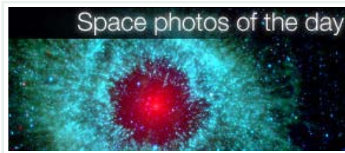
Space photos of the day 08/06