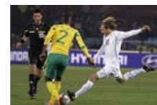
Africa Monitor: South Africa World Cup hopes dashed by Diego Forlan