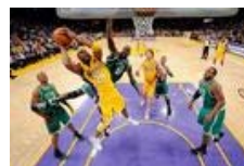
NBA Finals: Celtics, Lakers have game 7 date with history