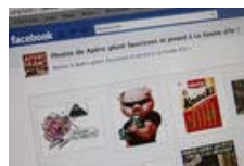
Facebook draws 7,000 to anti-Muslim pork sausage party in Paris