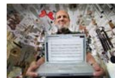
How a computer program became classical music's hot, new composer