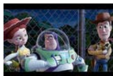
'Toy Story 3': Pixar's 'Toy Story' movies keep getting better and better