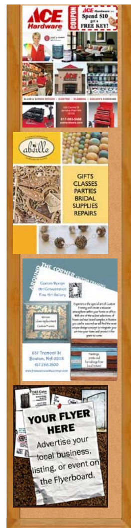
Local advertising by PaperG